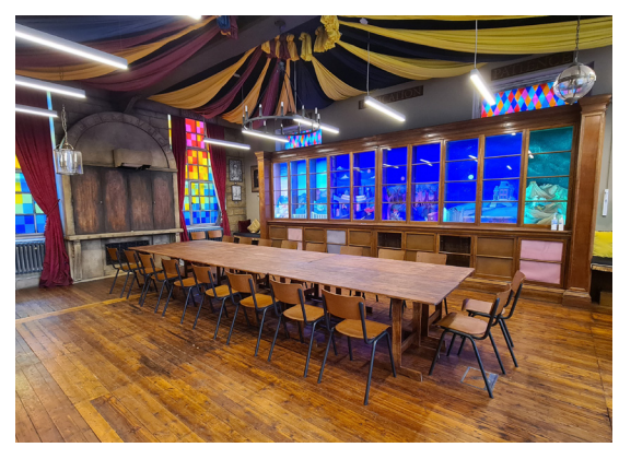
THE MAGIC COMMON ROOM