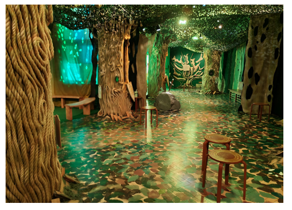
THE WHISPERING WOOD