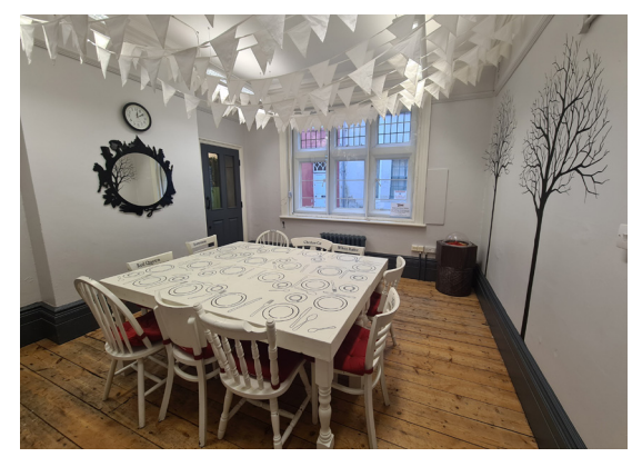
THE ALICE ROOM