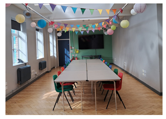
THE LINK ROOM